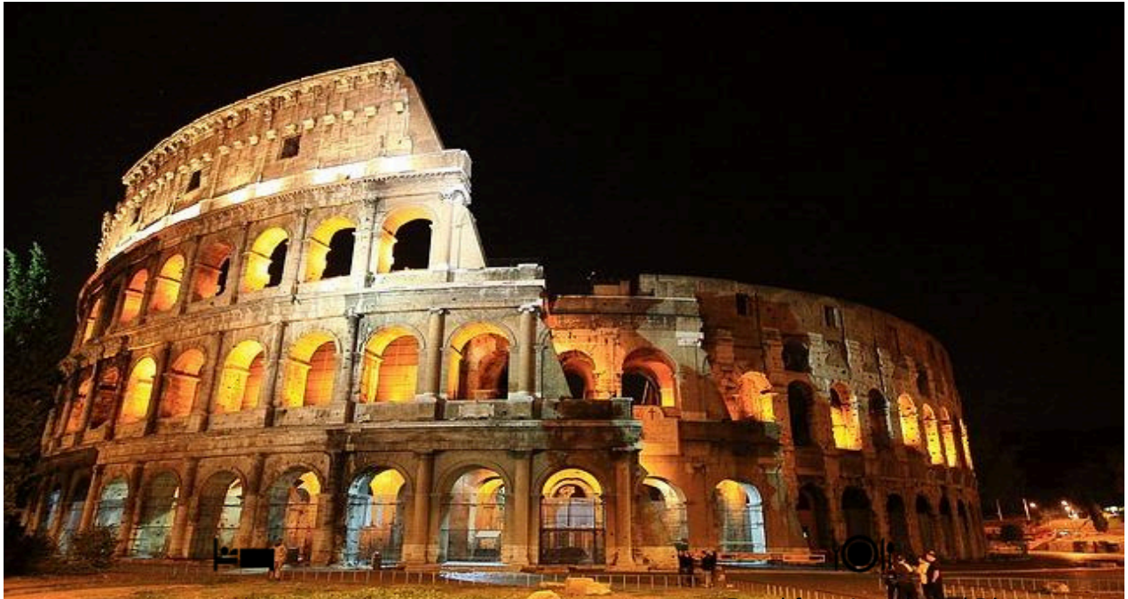
Breakfast, Lunch and Dinner

Spacious 3-star hotels with modern amenities